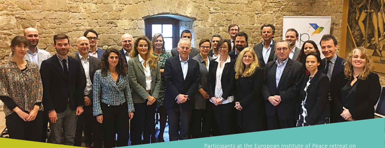
Participants at the European Institute of Peace retreat on Economic Diplomacy and Peacemaking at Château Jemeppe, January 2020.