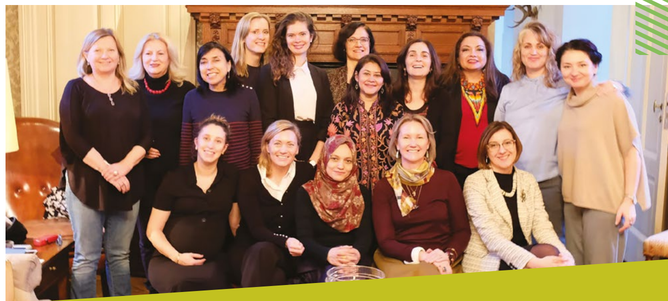
Participants at a European Institute of Peace event as part of the 'Women Setting Tables' project at Château Jemeppe, Belgium, January 2020.